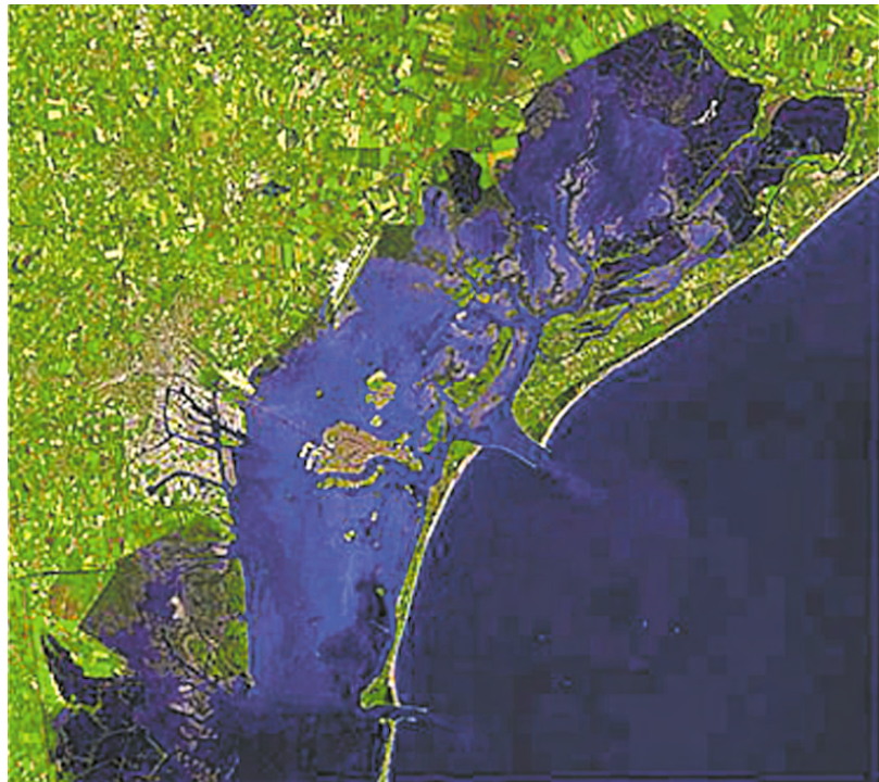
Remote Sensing Tutorial/GSFC/NASA

And again, where do they [the IPCC] get it from? They get it from their inspiration, their hopes, their computer models, but not from observation, which is terrible.